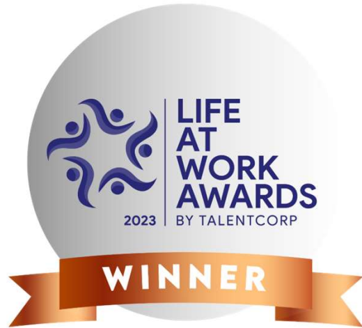
LAWA 2023 brandmark

LIFE AT WORK Awards (LAWA) 2023 winners are authorised and encouraged to use the LAWA brandmark to mark their achievement in promoting Diversity, Equity and Inclusion (DEI) in their workplace.